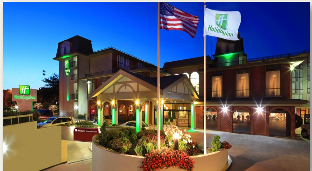
Holiday Inn Fisherman's Wharf; Our MRL home for a decade.